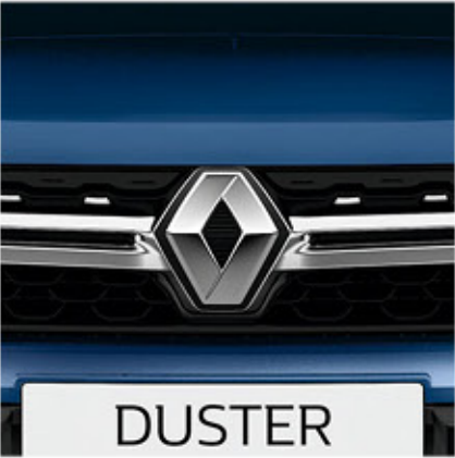
DUSTER COSMOS BLUE