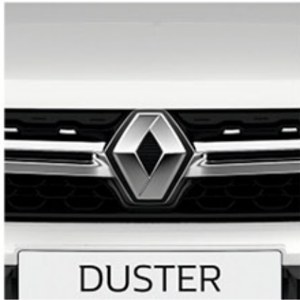
DUSTER GLACIER WHITE