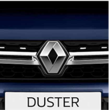
DUSTER NAVY BLUE