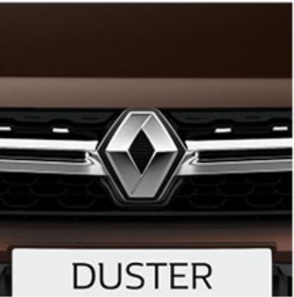
DUSTER TOURMALINE BROWN