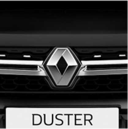
DUSTER PEARL BLACK