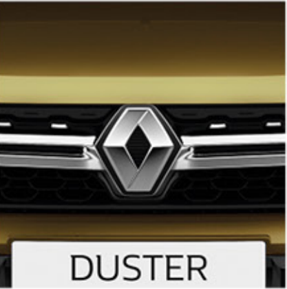
DUSTER ALTAI GREEN