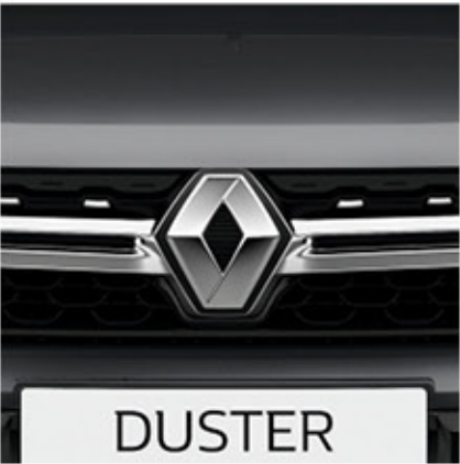
DUSTER COMET GREY